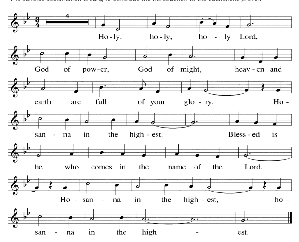
SANCTUS The Sanctus acclamation is sung to conclude the introduction to the eucharistic prayer.

We now offer you our praise, with angels and archangels and the whole company of heaven who sing of your unending glory: